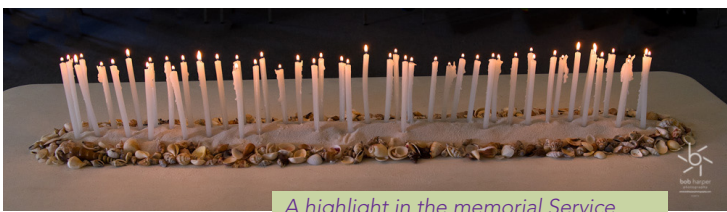
A highlight in the memorial Service