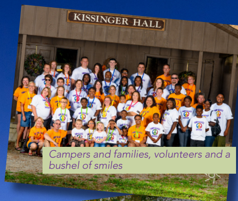
Campers and families, volunteers and a bushel of smiles