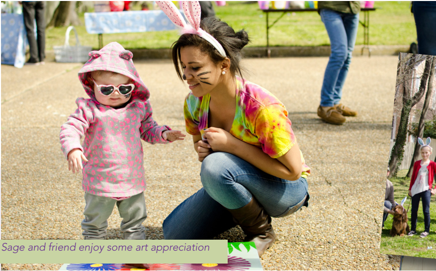
Sage and friend enjoy some art appreciation