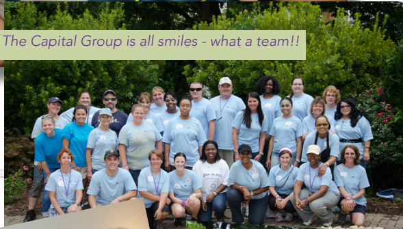
The Capital Group is all smiles - what a team!!