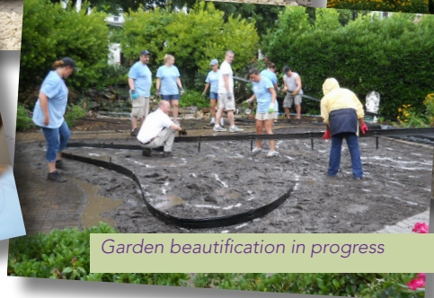
Garden beautification in progress