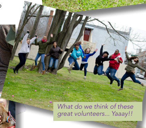
What do we think of these great volunteers... Yaaay!!