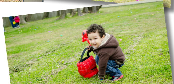
Oh goody! I found one!