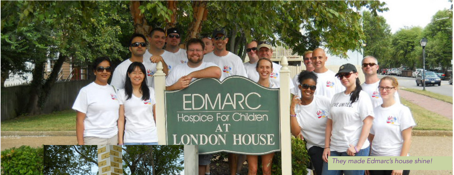
They made Edmarc's house shine!