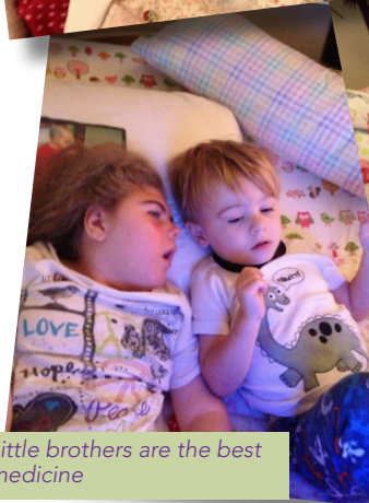
Little brothers are the best medicine