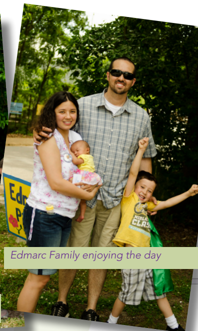
Edmarc Family enjoying the day