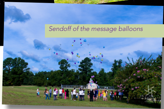
Sendoff of the message balloons