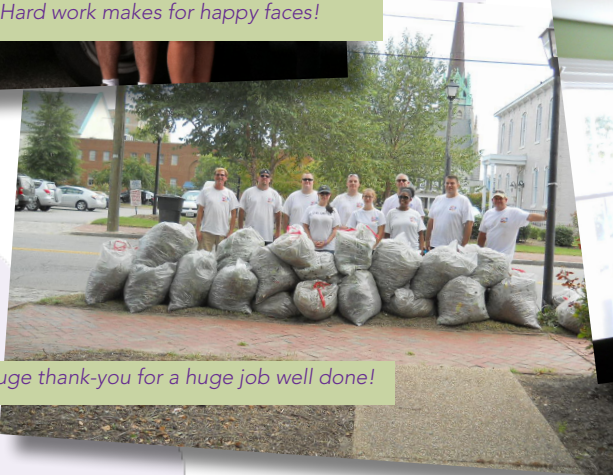
A huge thank-you for a huge job well done!