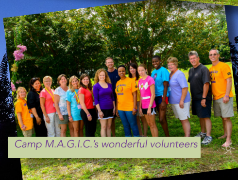
Camp M.A.G.I.C.'s wonderful volunteers