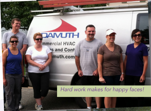
Hard work makes for happy faces!