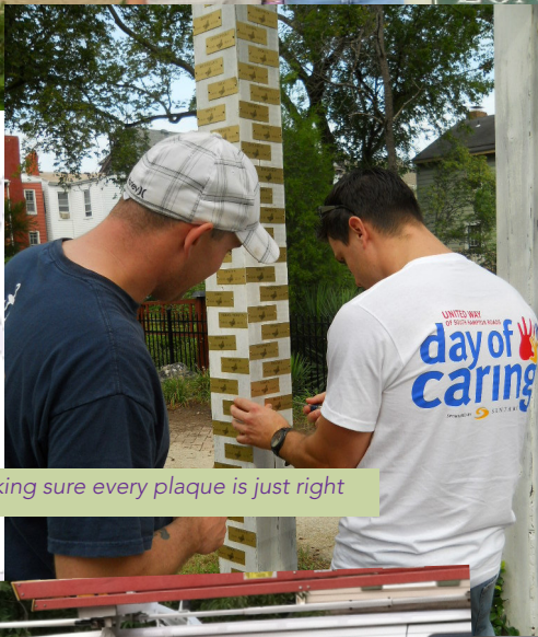
Making sure every plaque is just right