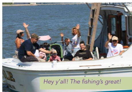
Hey y'all! The fishing's great!