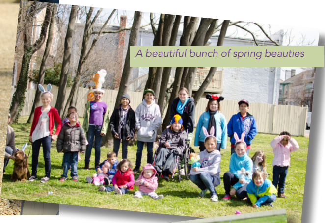
A beautiful bunch of spring beauties