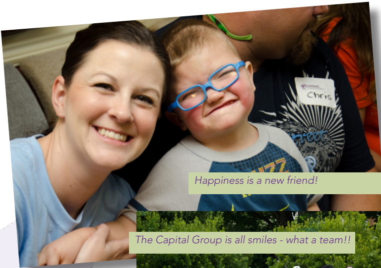
Happiness is a new friend!