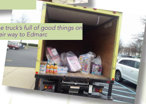
The truck's full of good things on their way to Edmarc