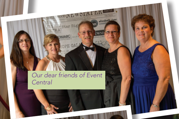
Our dear friends of Event Central