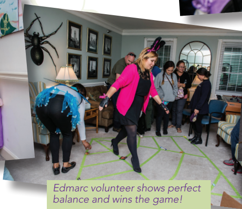
Edmarc volunteer shows perfect balance and wins the game!