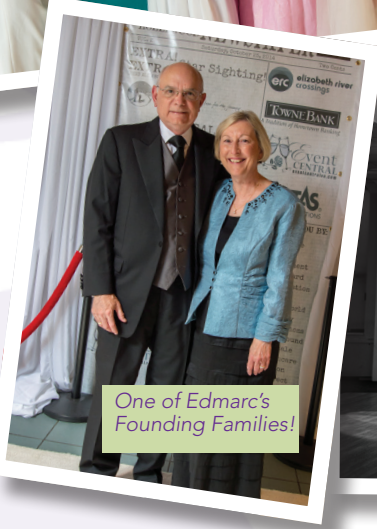
One of Edmarc's Founding Families!