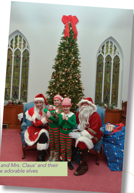
'Mr. and Mrs. Claus' and their three adorable elves