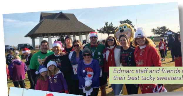
Edmarc staff and friends sporting their best tacky sweaters!