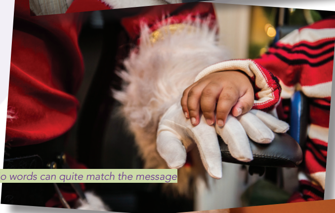
No words can quite match the message