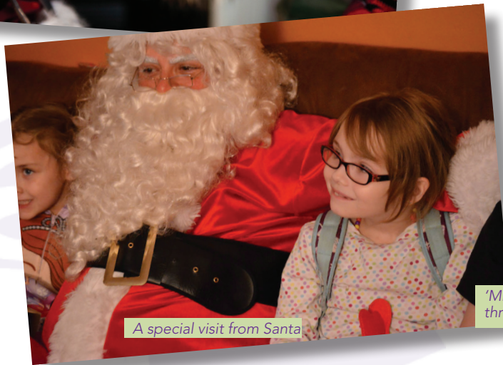
A special visit from Santa