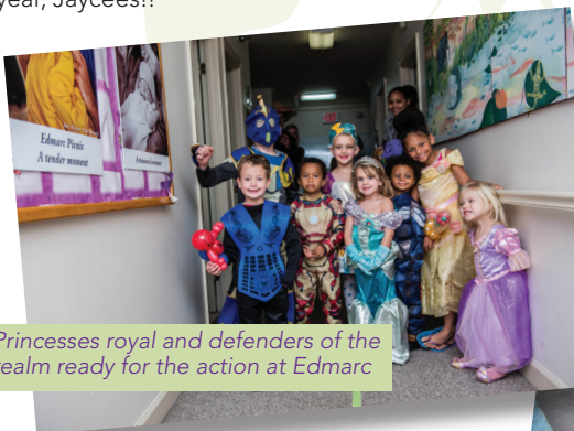
Princesses royal and defenders of the realm ready for the action at Edmarc