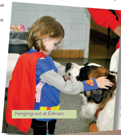
Hanging out at Edmarc