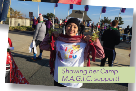
Showing her Camp M.A.G.I.C. support!