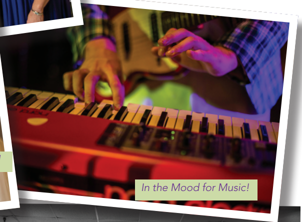
In the Mood for Music!