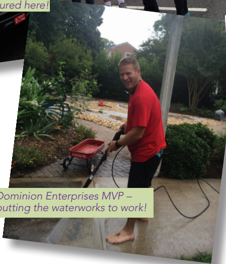
Dominion Enterprises MVP – putting the waterworks to work!