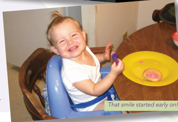
That smile started early on!

quality in the face of tragedy. It is the flicker of light that was all but lost when hope seemed just outside of our grasp.