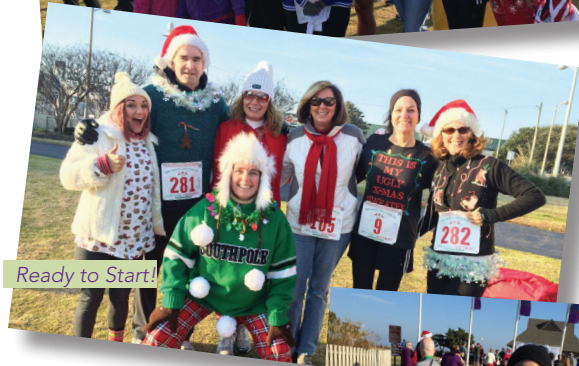
Ready to Start!