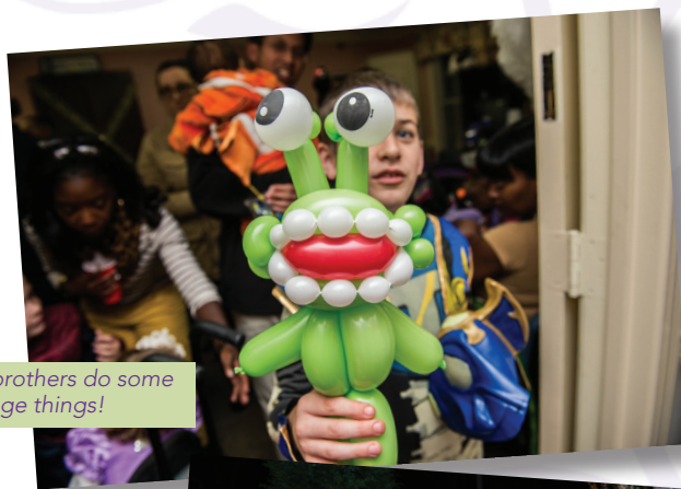
Big brothers do some strange things!