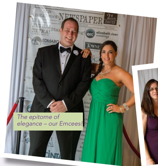
The epitome of elegance – our Emcees!