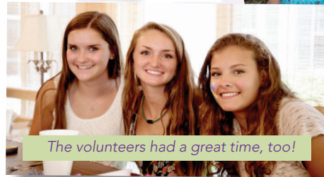
The volunteers had a great time, too!