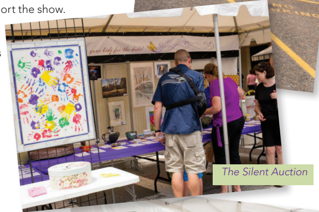
The Silent Auction