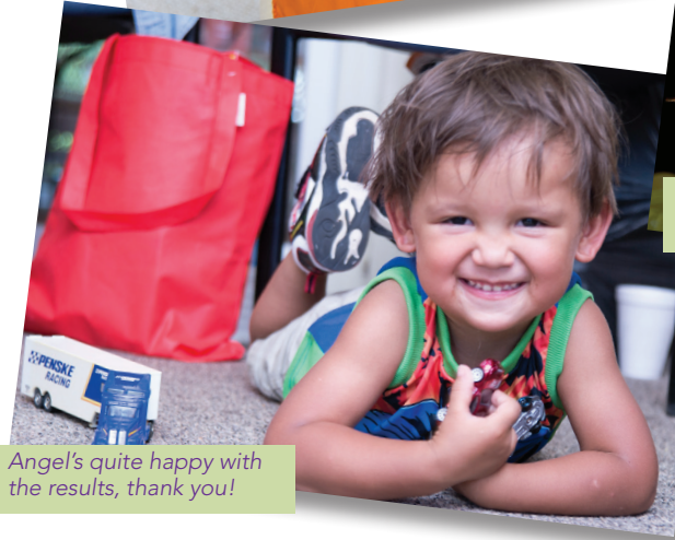
Angel's quite happy with the results, thank you!