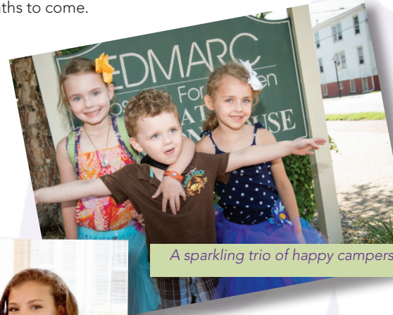
A sparkling trio of happy campers