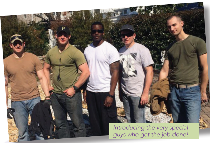
Introducing the very special guys who get the job done!