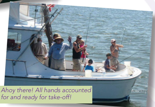
Ahoy there! All hands accounted for and ready for take-off!