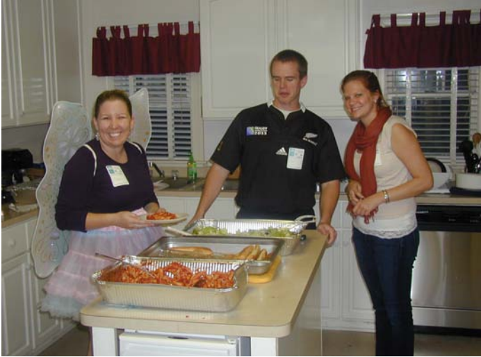
{Norfolk Jaycees, butterfly included, hard at work fixing fabulous food from Gusto's}

The Fall Festival is an event that our families look forward to each and every year. We can't thank the Norfolk Jaycees enough for continuing to sponsor and make it the family fun event that it is. Thank you ALL!!