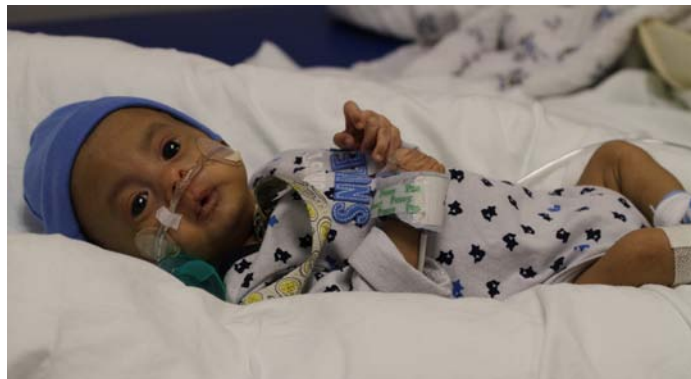
{Our world in a tiny bundle}

We learned the grim statistics about Trisomy-18. Most babies die before birth and those that do survive usually live only a few days. Ninety percent pass away before making it to their first birthday. Our child has already exceeded expectations. I had originally wanted to wait until the delivery to find out the gender of our child. I changed my mind when my wife suggested that we do a baby reveal party. It was a terrific little event amongst close friends. We cut the cake and pulled out a piece that had blue icing on the inside. Blue for a boy.