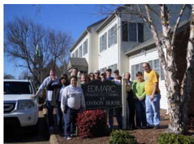
{Ganders gathered together after a job superbly accomplished (2012) }