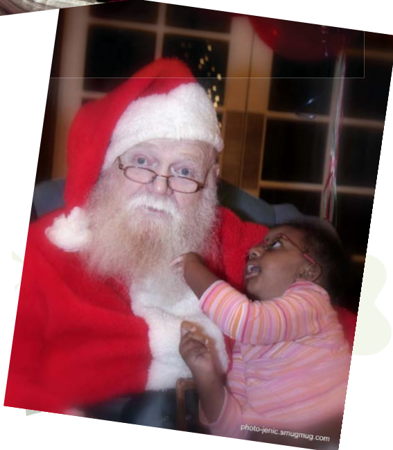
Bottom Picture - Miracle confides, "...And then, if you please, I'd like..."