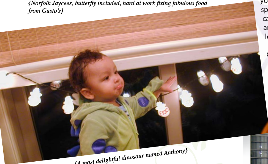
{A most delightful dinosaur named Anthony}