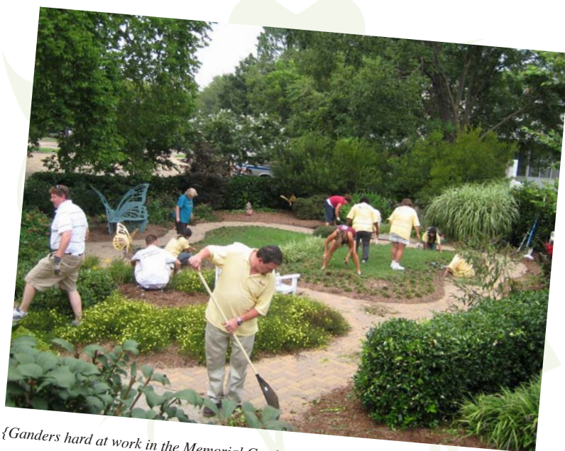
{Ganders hard at work in the Memorial Garden}