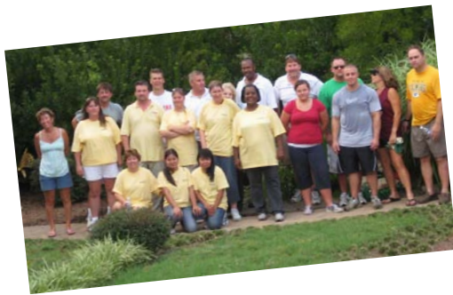
{A group photo from 2008}

Most recently, they painted the interior hallways and stairwells at London House. They were able to have the supplies donated by Sherwin-Williams.