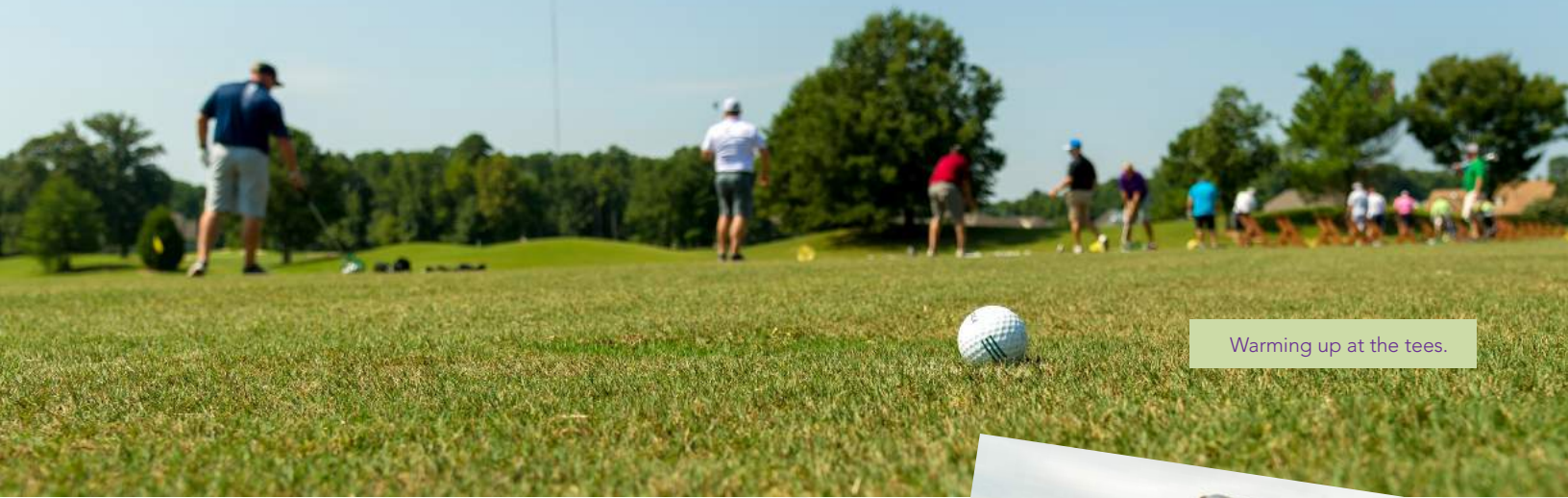
Warming up at the tees.