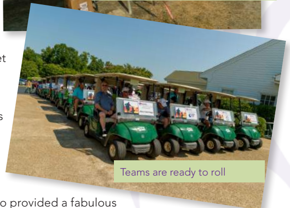
Teams are ready to roll