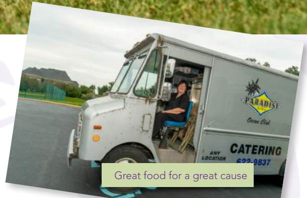
Great food for a great cause

Mark your calendar for Thursday, August 16, 2018 for next year's tournament.