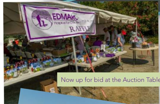
Now up for bid at the Auction Table