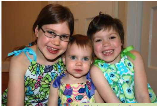
This is what family means

Throughout these years, the Edmarc nurses and staff have taught me so many things. Not just the hundreds of medical things I've